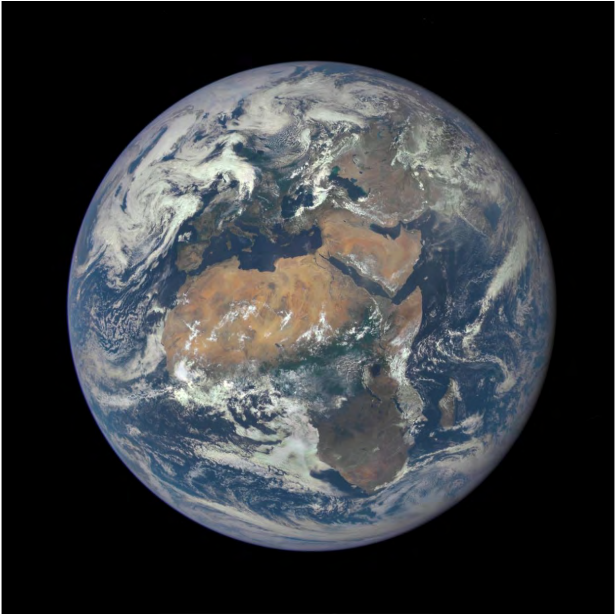
'EPIC' View of Africa and Europe from a Million Miles Away